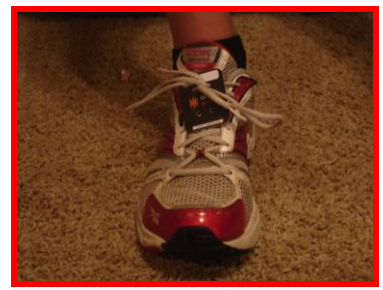
Tie shoe laces as you normally do

Runners with shoes that have no laces please see a member of ARMS staff for a plastic tie.