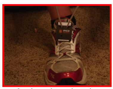
Insert laces through top two holes